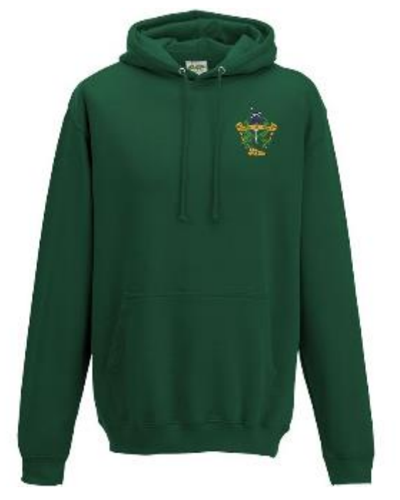
The wearing of school hoodies is acceptable dress code